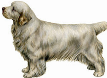
Clumber Spaniel Bitch