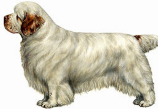
Clumber Spaniel Dog