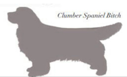
Clumber Spaniel Bitch