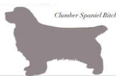
Clumber Spaniel Bitch